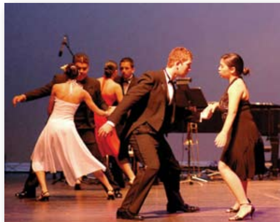
Andrew P. Hill High School Students San Jose, California