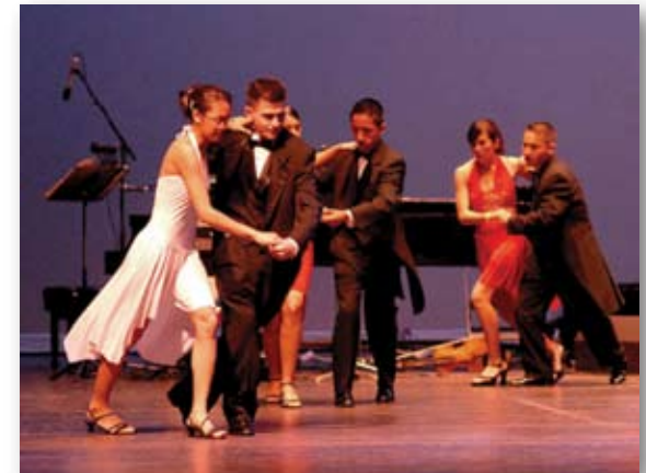
SPONSOR a senior or a child